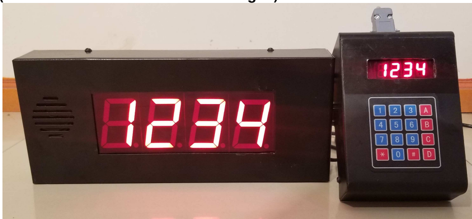
Project picture for single set token display

TDS-03 : 4 Digit 1 set with Digit size 2" in FND Cost Rs. 2,500/- ( TDS-04 is similar with 4" FND 4 Digits)