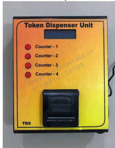
TDP4 Rs. 12,000/-