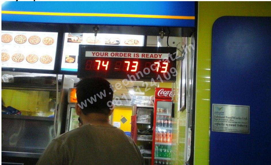
T2-3D4S: 3 Digit 4 set. Digit 2" FND ( Size 15" x 20" or 8" X 40" ) Cost Rs. 7,000/-