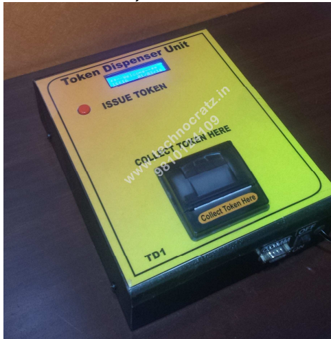
Token Dispenser TDP1 Rs. 10,000/-