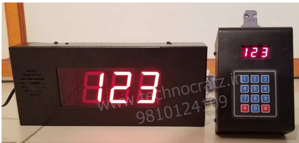
TDS-02 : 3 Digit 1 set with Digit size 4" in FND Cost Rs. 2,600/-